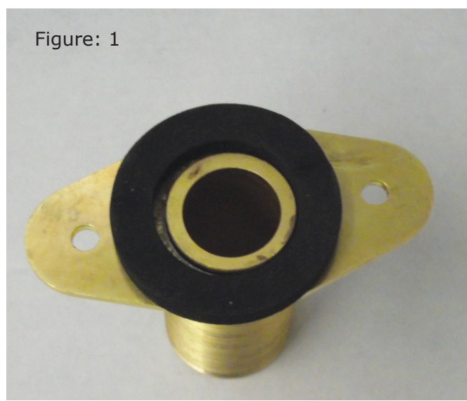
Figure: 1 Put seal on the end of waste fixing and place over waste outlet at rear of basin. See Figure 2.