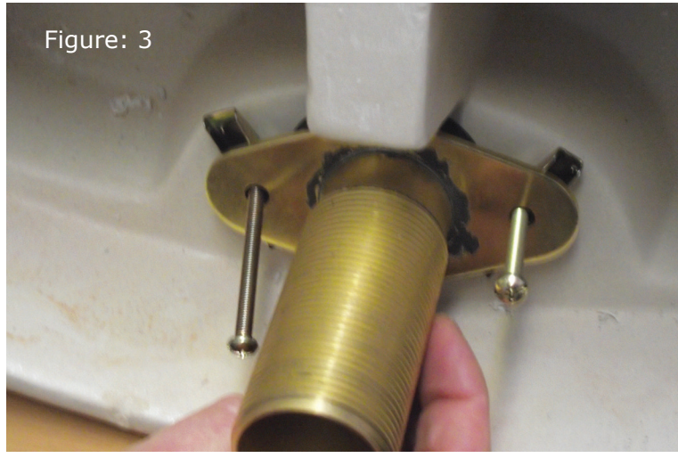
Figure 3: Using fixing bolts and butterfly clips screw waste fixing to basin.