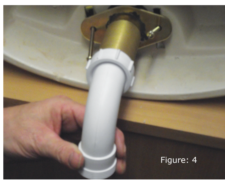
Figure 4: Fasten waste connector on to waste outlet.