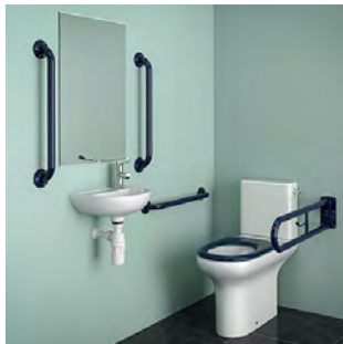
SCDMCCLB: SanCeram Close Coupled WC Doc M Pack - Left hand, Blue