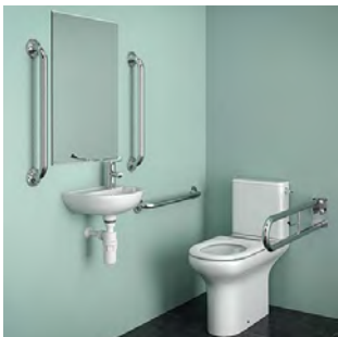
SCDMCCLSS: SanCeram Close Coupled WC Doc M Pack - Left hand, Stainless Steel