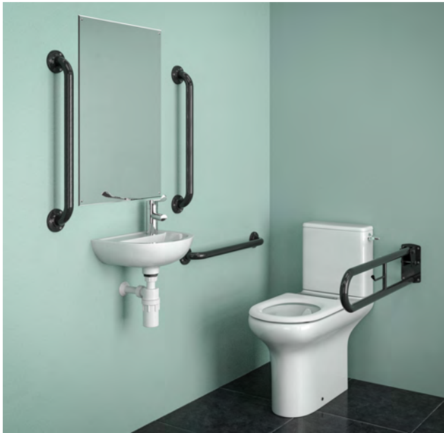
SCDMCCLG: SanCeram Close Coupled WC Doc M Pack - Left hand, Dark Grey