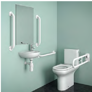
SCDMCCLW: SanCeram Close Coupled WC Doc M Pack - Left hand, White