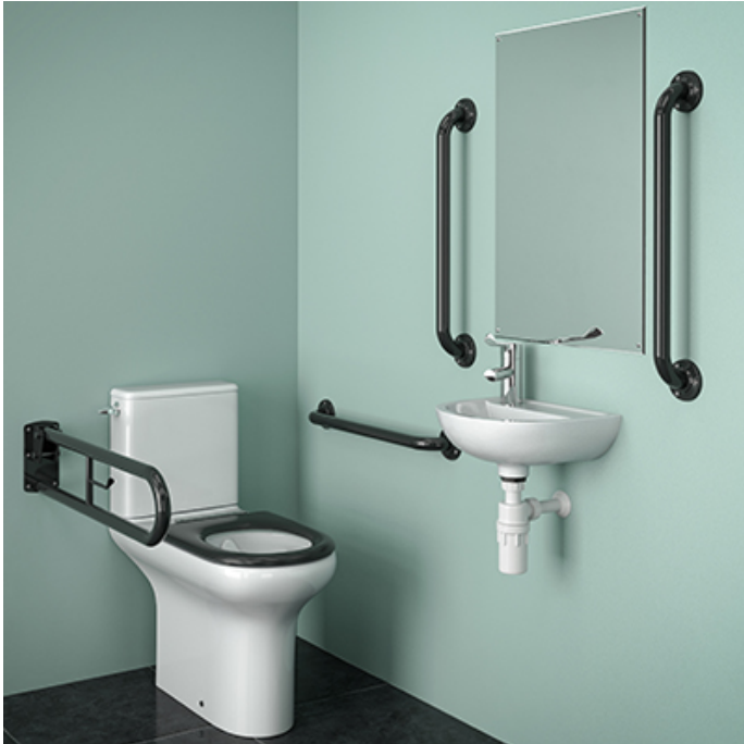
SCDMCCR G : SanCeram Close Coupled WC Doc M Pack - Right hand, Dark Grey