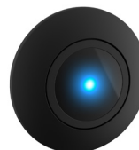
Matt Black CIST216B