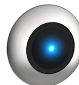
Stainless Steel CIST216SS