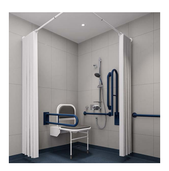
SWCDMSHCB: SanCeram Concealed Shower Doc M Pack - Blue