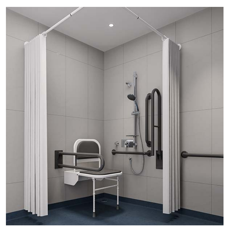
SWCDMSHCG: SanCeram Concealed Shower Doc M Pack - Grey