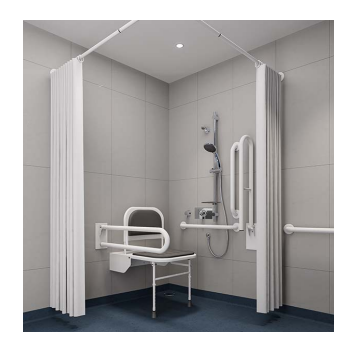
SWCDMSHCW: SanCeram Concealed Shower Doc M Pack -White